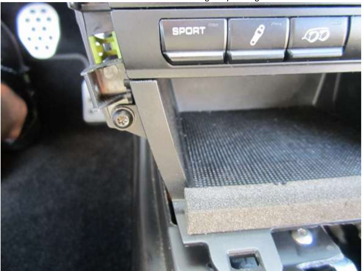
#8. You are ready to pull the console out but first locate the wire connector on the inside right front of the console and disconnect it. Have the emergency brake handle pulled up. Pull the console up and out of position.

#7. Remove the 2 T20 torx screws holding the very front of the console on. Next remove the 2 T20 torx screws holding the the storage tray on just below the radio. Pull the storage tray out by pulling it straight out. Last remove the one T20 torx screw under the storage tray holding the console in.