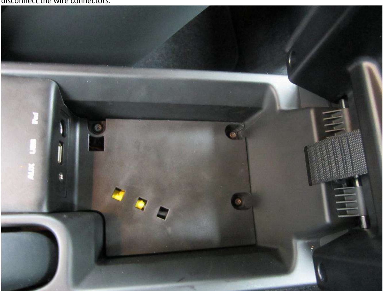
#2. Next pop off the cover in front of the emergency brake handle by pulling up on the front first and remove the screw.

#1. Open up your center console storage compartment and remove the rubber mat and remove the 3 T20 Torx screws. Next remove the plastic cover to expose the final screw and remove it. Then disconnect the wire connectors.